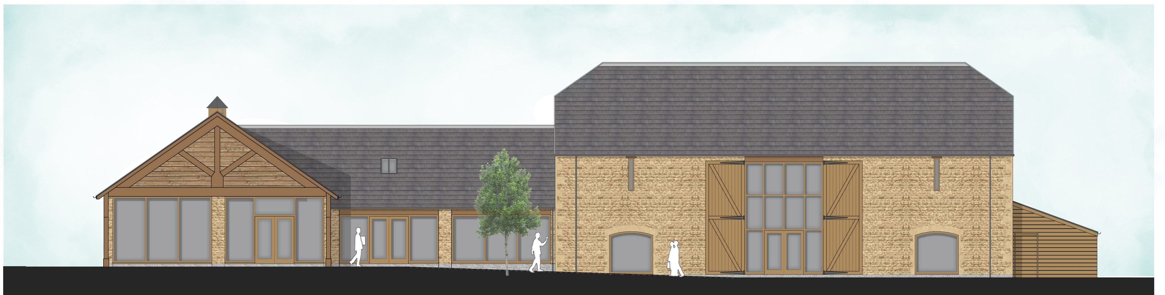
South - East Internal Elevation