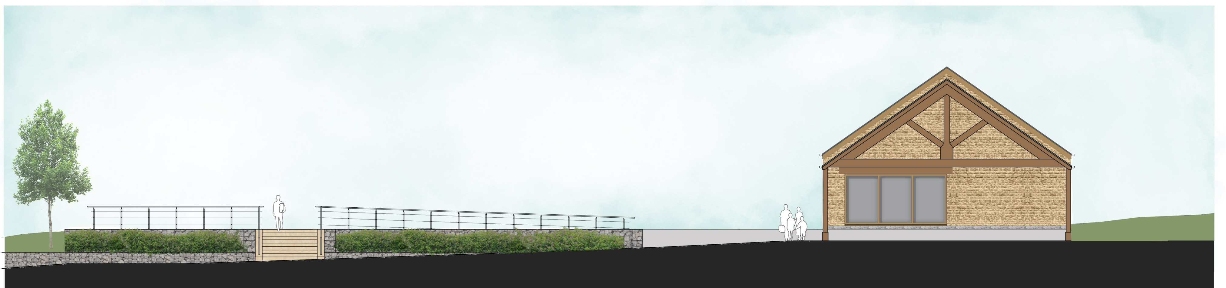
North - West Internal Elevation