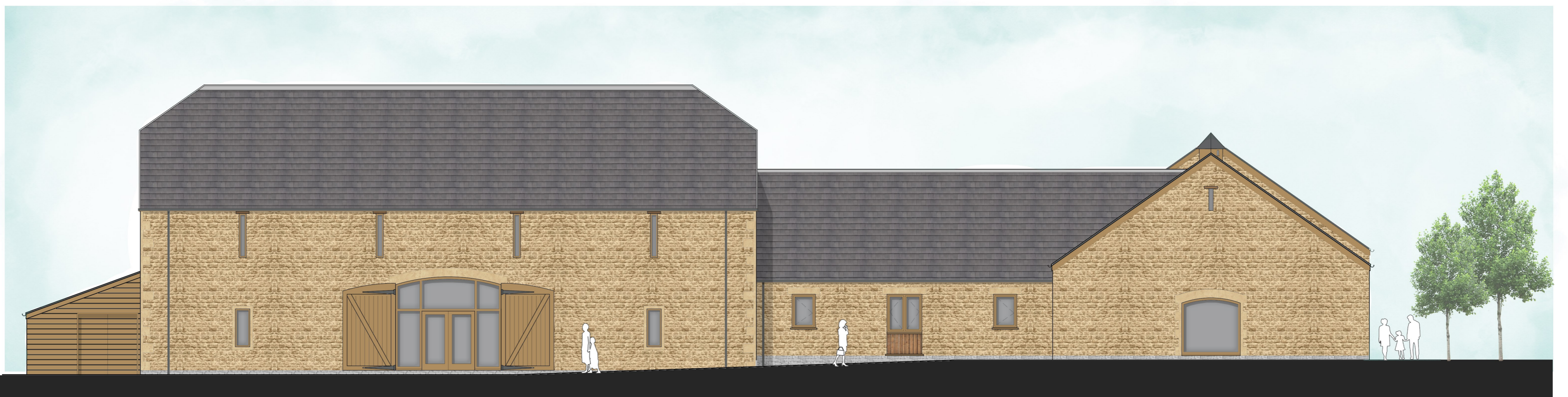
North - West Elevation