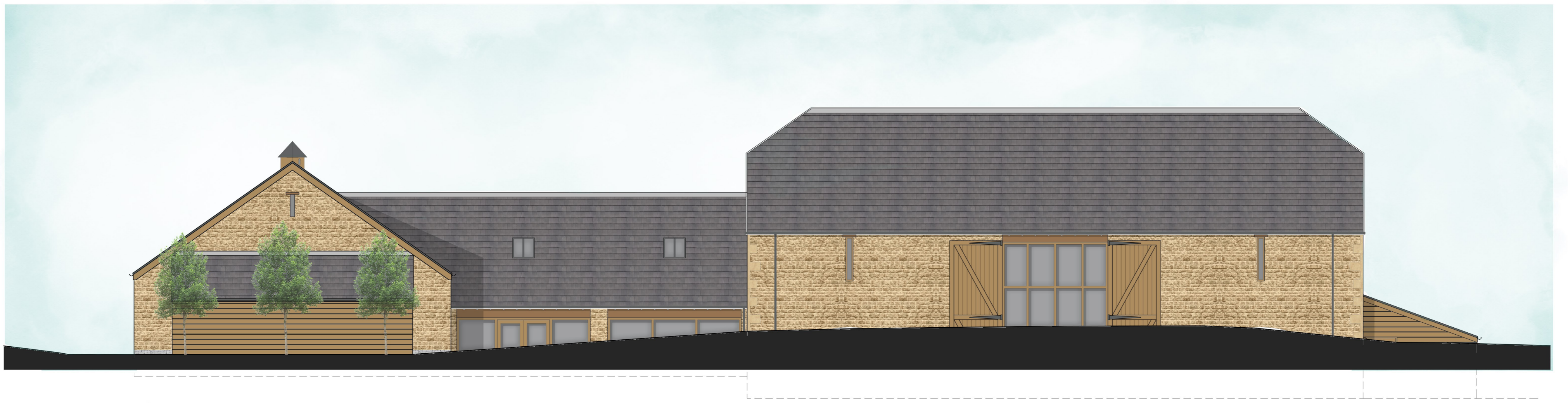
South - East Elevation